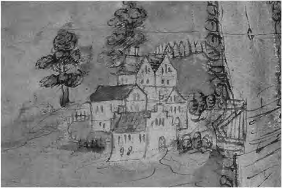
Fig. 1 The Moat c.1560, CCA Map 49.

from the Littlebourne road and Moat Gate is labelled. This map may be related to the Finch lawsuits, pretending to show Moat as former St Augustine's Abbey land. The house is coloured red, for bricks, but this might be brick cladding over timber framing. The same house is on a large map drawn to show the archbishop's landholding near Canterbury c.1640 (CCA Map 123). The Moat site is coloured yellow like St John's Hospital and the Palace. The four ranges and the eastward extension are enclosed in a moat. There is a yard in front of the house with two lodgings and an arched gate within the moat. A survey of the estate was made in 1600 (EK/U449/E1). Later in 1635 (EK/U449/E6) a map was drawn which is now represented by a copy of 1832 (Oxford, Bodl. MS C 17: 36(51)). In mapmakers' shorthand the house is shown as two separate ranges with a yard between them, with some outbuildings. The drive is lined by trees and there are trees between Callis Field and Chapel Field, near the house, where the de Wykes had built a chapel in the fourteenth century (1333). Many of the fields are named.