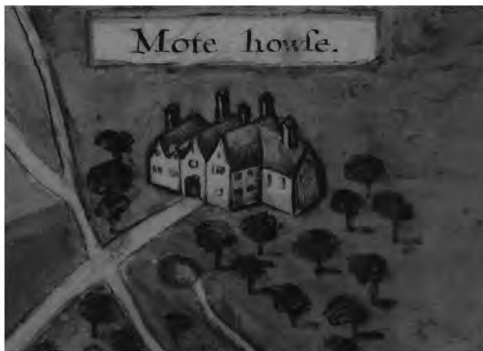
Fig. 2 The Moat c.1600, CCA Map 5 copied from Map 57 in 1734.

new building in the yard was published in 1787, after the house had been pulled down (Nichols 1787, XLII, pl. iv).